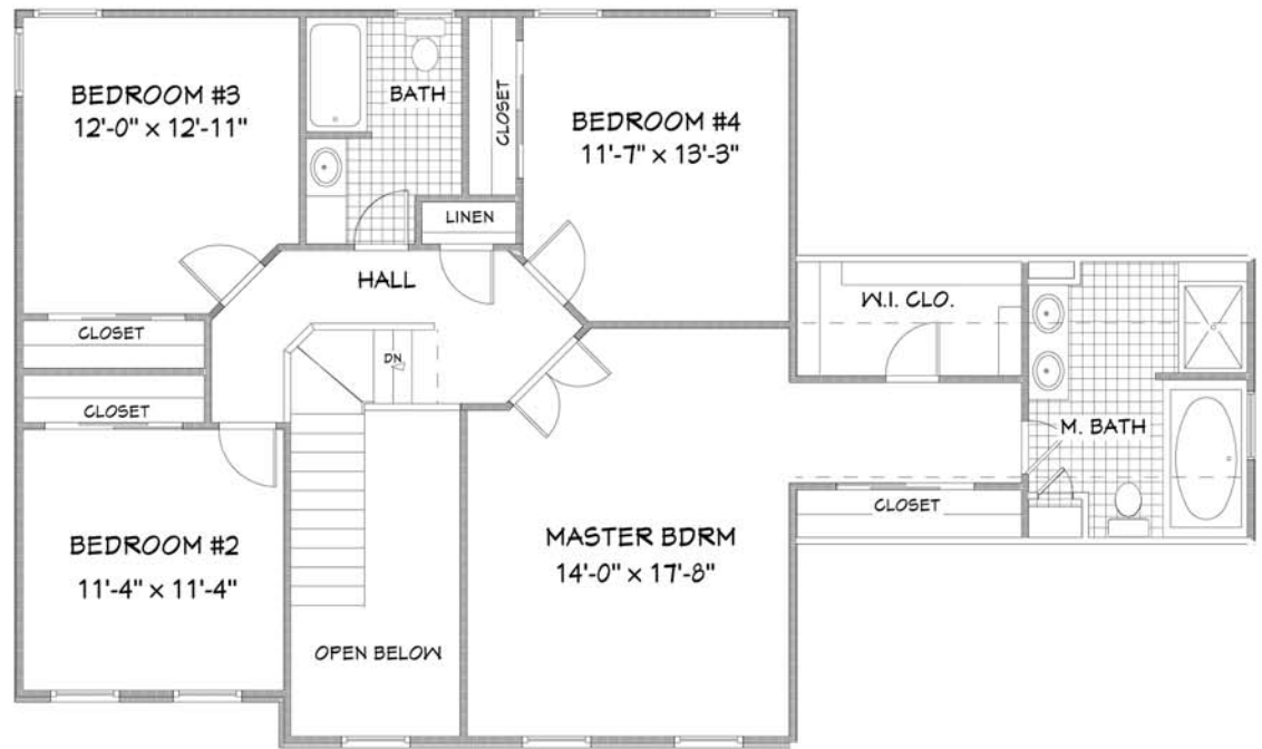
SECOND FLOOR (1,236 SQ.FT.)

Greth CRAFTED WITH CARE Homes SM SINCE 1973